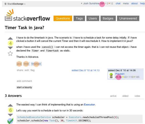
Fig. 1. Screen snap of the StackOverflow question page.

We mined Stack Overflow, a widely-used developer forum, primarily to identify the characteristics of protocol tasks that are difficult for programmers (RQ1). We discuss the strengths and weaknesses of StackOverflow data in Section IV-A. We downloaded the entire Stack Overflow database which is freely available to anyone under a Creative Commons license. When this study was conducted there were 2.6 million questions on Stack Overflow. This is far too many to read and digest, so we winnowed the question list with the techniques we discuss in Section IV-B. The goal of the filtering was to focus our efforts on questions that were likely to be protocol-related and significant. Once we had a reasonable-sized list of questions, we manually read each questions to: 1) determine if the question was protocol-related, 2) distill a task, and 3) merge with existing tasks. This study’s aim is to characterize recurring protocol problems, but does not attempt to estimate commonality. The study also required a lot of manual labor, so we likely excluded many protocol question for the sake of efficiency. The strategies we used in all of these efforts are discussed in Section IV-C.