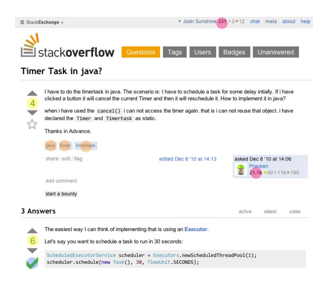
Fig. 1. Screen snap of the StackOverflow question page.

We mined Stack Overflow, a widely-used developer forum, primarily to identify the characteristics of protocol tasks that are difficult for programmers (RQ1). We discuss the strengths and weaknesses of StackOverflow data in Section IV-A. We downloaded the entire Stack Overflow database which is freely available to anyone under a Creative Commons license. When this study was conducted there were 2.6 million questions on Stack Overflow. This is far too many to read and digest, so we winnowed the question list with the techniques we discuss in Section IV-B. The goal of the filtering was to focus our efforts on questions that were likely to be protocol-related and significant. Once we had a reasonable-sized list of questions, we manually read each questions to: 1) determine if the question was protocol-related, 2) distill a task, and 3) merge with existing tasks. This study's aim is to characterize recurring protocol problems, but does not attempt to estimate commonality. The study also required a lot of manual labor, so we likely excluded many protocol question for the sake of efficiency. The strategies we used in all of these efforts are discussed in Section IV-C.